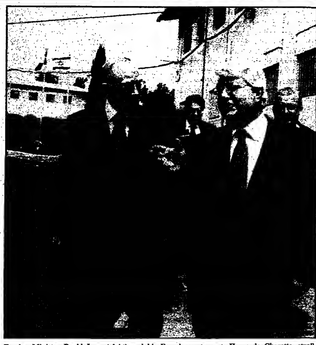
Foreign Minister David Levy (right) and his French counterpart, Herve de Charette, stroll through the grounds of the Foreign Ministry in Jerusalem yesterday.